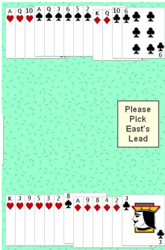
RESULTS OF BOARD 32

Looking at the traveler below from Saturday afternoon's game at last week's Sectional, it is clear that the N/S field had some trouble with Board 32. None of the 24 pairs found the cold red suit slam, and 1/3 of the field failed in their contract. Is the South hand worth a 2/1 after partner opens 1♠? I didn't think so. After South bids a forcing 1N, what is the best rebid by N? If North rebids 3♠, a clear underbid in my opinion, can South risk a 4♥ call? How does your partnership handle one suited hands too strong for jump rebids. Here is one treatment that would have worked fabulously, a rebid of 2N over 1N forcing as an artificial game force: http://www.bridgewinners.com/index.php/bridge-articles/88-expert/47-five-bidding-approaches-i-know-are-right . This "power relay", as presented, allows responder to transfer with a long heart suit. All 3 card limit raises employ a 3♥ rebid by responder. Others play that opener's jump shift to 3♣ can be artificial? If you reached hearts on this hand, how did you do it?